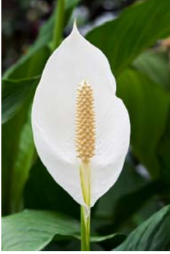
Peace Lilly in bloom